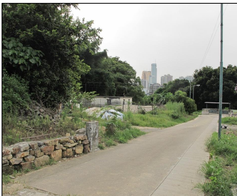
To R6 Residents of Muk Wu Nga Yiu