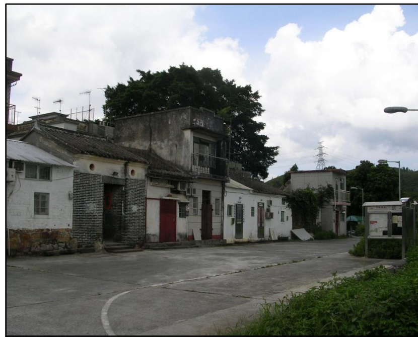
To R4 Residents of Muk Wu