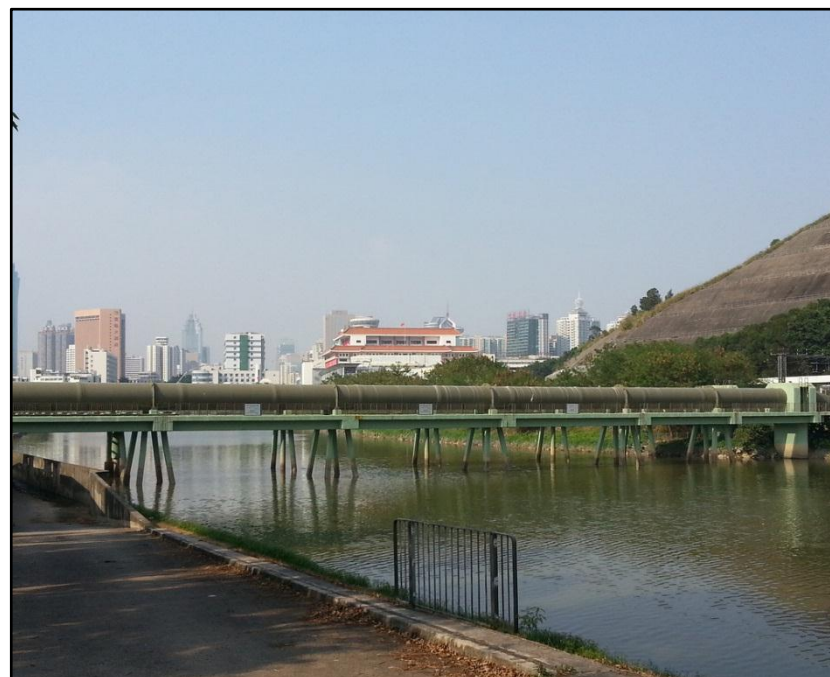
From R5 Residents of Villages along Foothill of Tai Shek Mo