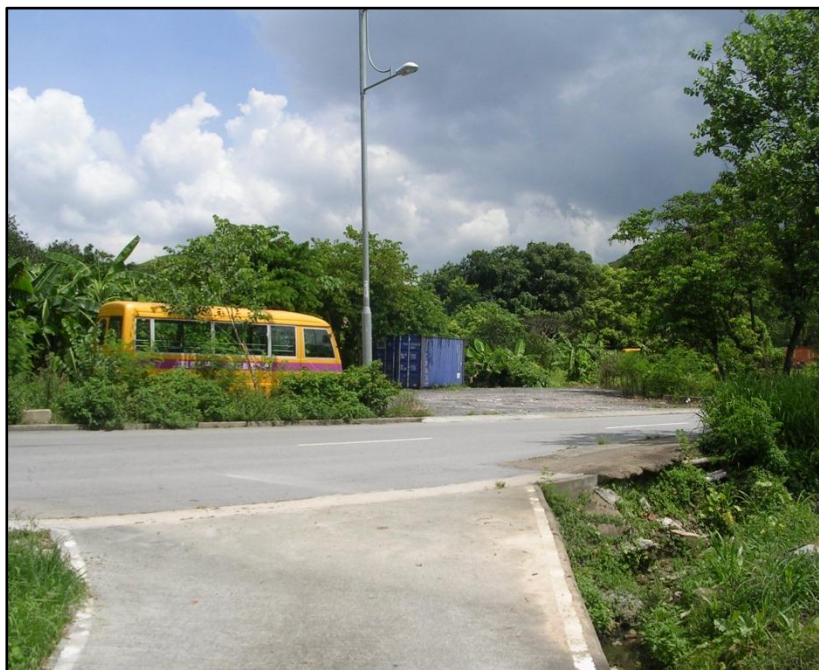
From R4 Residents of Muk Wu